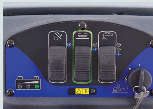
The SC750 ST / SC800 ST – provides simple operation and robust scrubbing controls.

For use on extreme soil levels (10% of scrubbing applications)