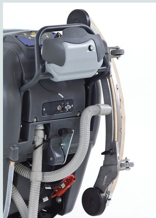
A built-in squeegee hanger makes transport easier and reduces trip and fall accidents.