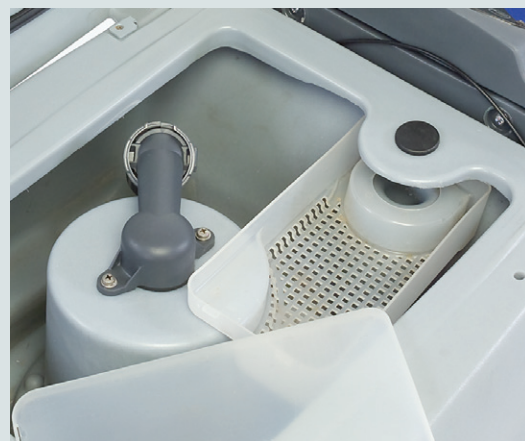
An integrated debris catch cage traps and collects drain clogging debris.