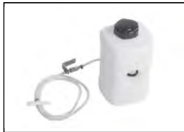
CHEM DOSE SYSTEM