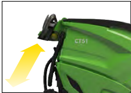
ADJUSTABLE HANDLE FOR COMFORTABLE AND EASY USE