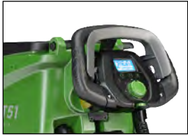
FULL MACHINE CONTROL DUE TO INTUITIVE CENTRAL DIAL