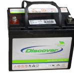
12 V 84 AGM 12V84-AGM