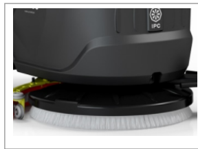
SPIN-ON, SPIN-OFF BRUSH