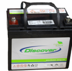
12 V 84 AGM 12V84-AGM