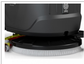
SPIN-ON, SPIN-OFF BRUSH