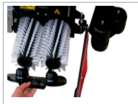
COMBINED SCRUBBING-SWEEPING SYSTEM THAT INCLUDES DEBRIS HOPPER ON CYLINDRICAL