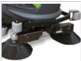
PRE-SWEEP SYSTEM ON CYLINDRICAL MODEL