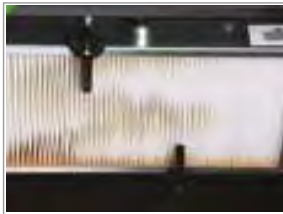
ELECTRIC FILTER SHAKER