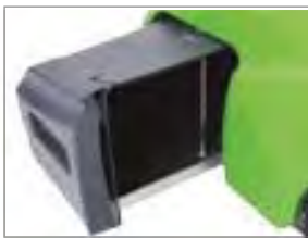
LARGE FRONTAL WASTE TRAY