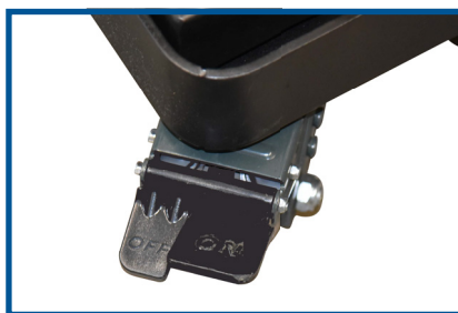
REAR LOCKING SWIVEL CASTERS