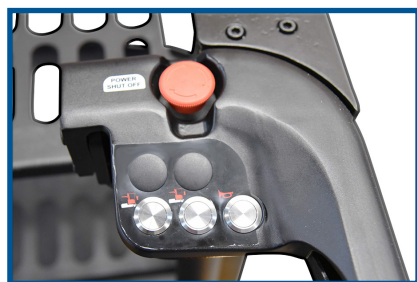
RIGHT HAND CONTROLS

The right-hand operator control pod features fingertip lift/lower buttons for the operator platform and a recessed emergency power disconnect. On the left-hand control pod, a cup holder, horn, and battery discharge indicator with hour meter are provided.