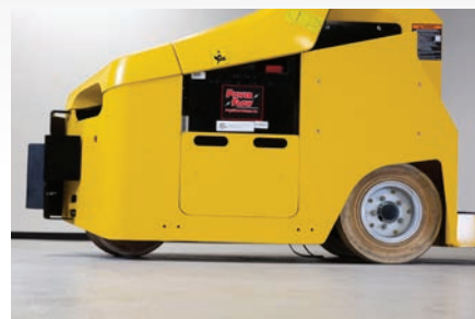
Front Dual Coil Suspension and Rear Coil Suspension with Shock Absorbers