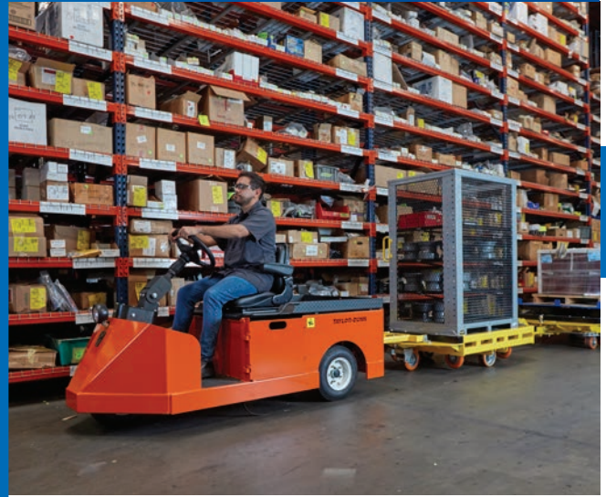
70 Years of Industrial Reliability