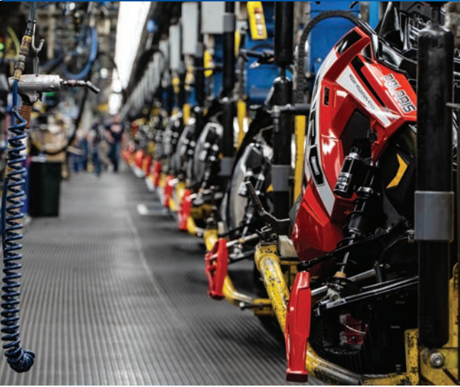
65 Years of Vehicle Innovation