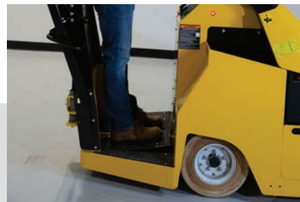
350 LB Capacity Operator Compartment