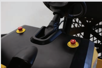
Two Sided Emergency Shut Off Buttons