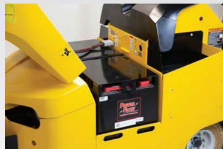
Easy Access Battery Compartment