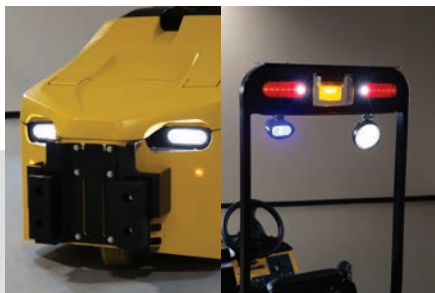
Safety Headlights and Large Front Push Bumper