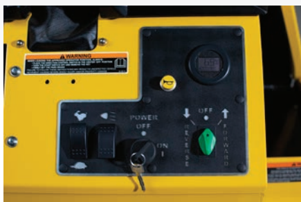
Control Panel with Battery Meter, Horn, Hi-Low Speed Switch