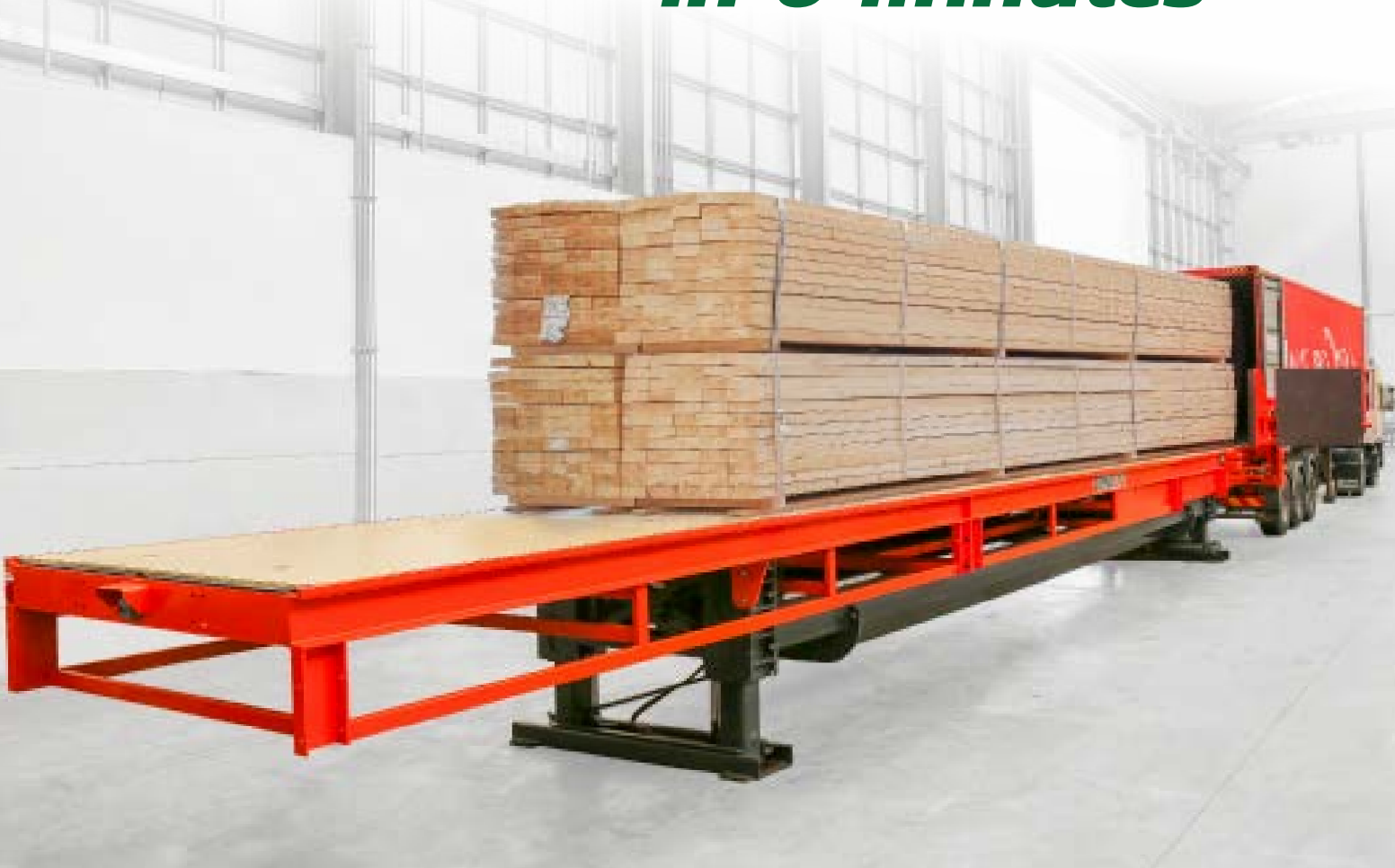
No additional dunnage required