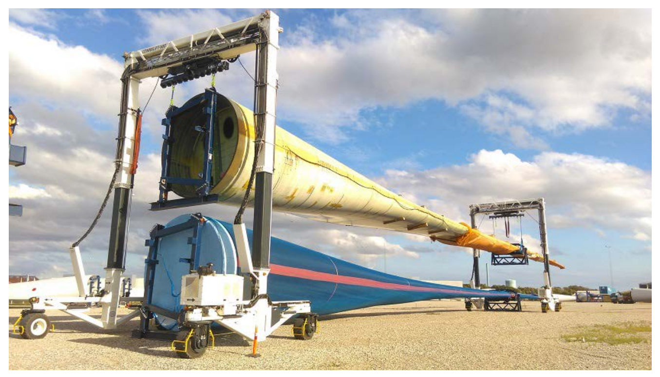
PICTURED ABOVE: 2 COMBi-MG machines working in tandem handling wind turbine blades